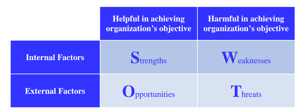
Figure 1. The SWOT Analysis Framework

COVID crisis, highlighting the main strengths, weaknesses, opportunities and threats that seems to affect its medium and long term plans. Finally, section 6 concludes.